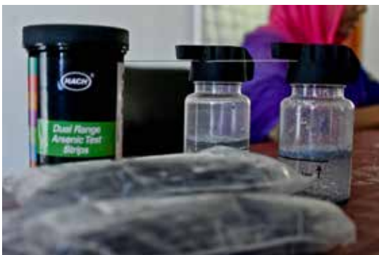
Measuring arsenic concentration using Hach Test Kit

Shahena and the rest of the group measured the arsenic presence in the water sample from these two tube wells using Arsenic Hach Test Kit.