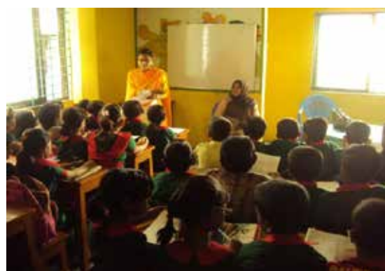
This photo was taken during the introductory class of the Health Education course.

Chittagong, also a school supported by Agami. The course was rewritten by Chemists Without Borders volunteers for the elementary school students at PSD Pearabag School.