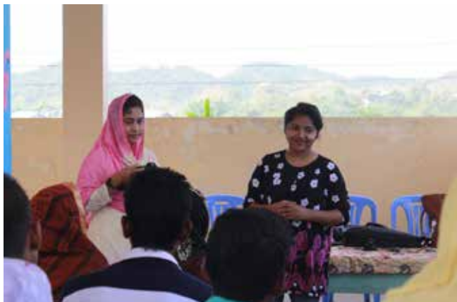
Introduction of the program

but the natural view of the hills from the roof top of the school, where the students held the presentation, and the enthusiasm of the students will make anyone feel eager to spend more time with the students.