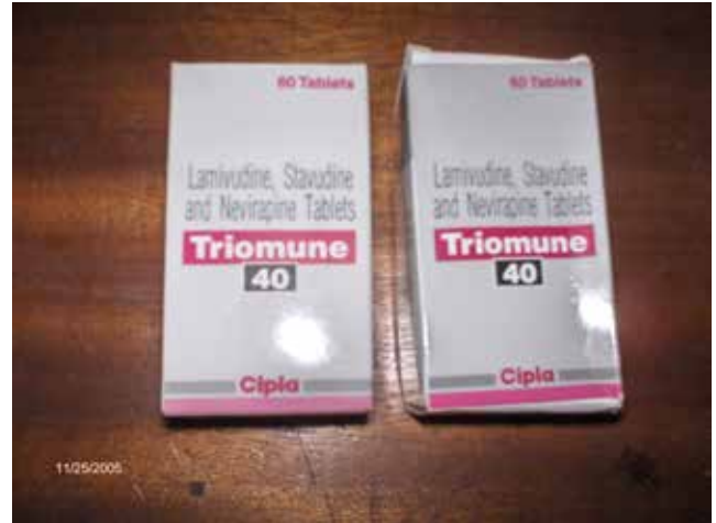
Comparison photos of legitimate drugs to their fake counterparts

AIDSfreeAFRICA has been working in Cameroon for the past 11 years. Recently, we have proposed to help with the task of analyzing a cross section of the existing drugs that are available in the country's pharmacies, hospitals, black market, and roadside shacks. It is difficult for the Cameroonian government to keep track and to know the exact conditions of the drugs, so they make assumptions based off of their origin. Just because a drug is from a trusted source doesn't mean that it will be viable by the time it reaches the patient. In Cameroon, each source of drugs serves a purpose and provides people of different economic backgrounds with the access to treatment. The question to be answered is: are the drugs a patient buys of high quality by the time they purchase them?