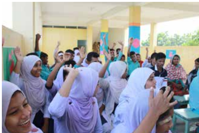
Questions and answers

The students came up in groups and presented the topics they were taught one by one. The first group explained the importance of clean water and how contaminated water can deteriorate our health. The second group explained the importance of regular health check-up to prevent heart diseases, diabetes and low or high pressure. The third group came up with examples of foods for nutrition and the next two groups explained the importance of hygiene and required sleeping time. Students discussed about the importance of mental health, which is mostly considered a taboo in the society. They explained stress, empathy, relationship, bullying and so on. Lastly, the students not only explained the importance of exercise and meditation but also demonstrated the whole act and later on encouraged everyone to practice.